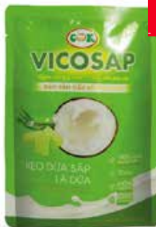
KẸO DỪA SÁP VỊ LÁ DỪA