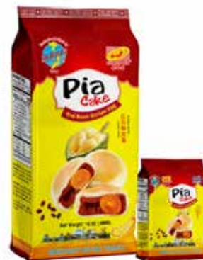
BÁNH PIA ĐẬU ĐỎ - SẦU RIÊNG - TRỨNG