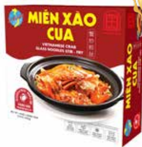
MIẾN XÀO CUA