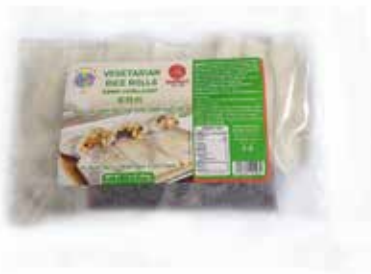
BÁNH CUÓN CHAY