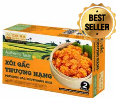
XÔI GÁC THƯỢNG HẠNG