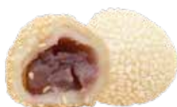
RED BEAN SESAME BALL DOUGH (BÁNH CAM NHÂN ĐẬU ĐỎ)