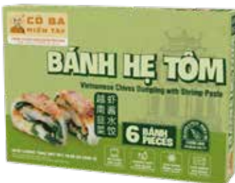
BÁNH HẺ TÔM