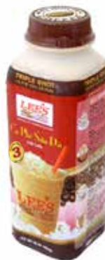
CAFE SỮA ĐÁ ĐẬM