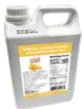
SPECIAL MANGO FLAVOR CONCENTRATED JUICE