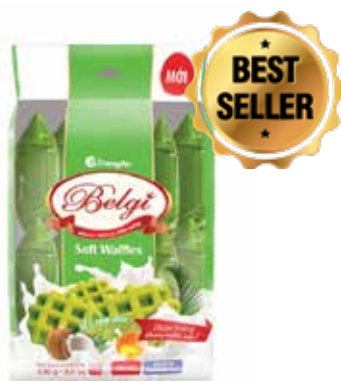
BÁNH TRÚNG SỮA MỀM VỊ LÁ DỨA