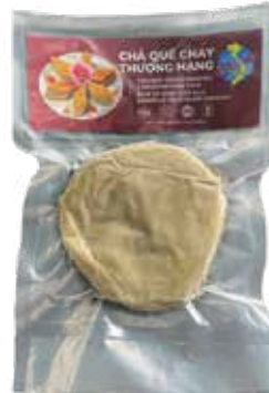
CHẢ QUẾ CHAY THƯỢNG HẠNG