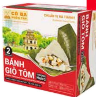
BÁNH GIÒ TÔM THƯỢNG HẠNG