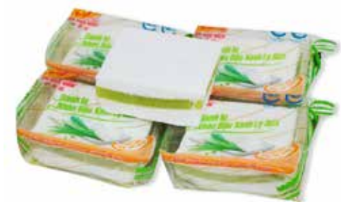
BÁNH IN - ĐẬU XANH LÁ DỨA