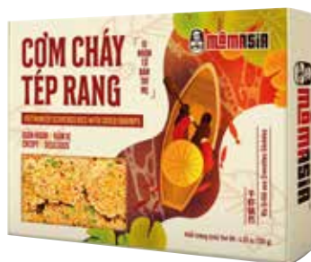
CƠM CHÁY TẾP RANG