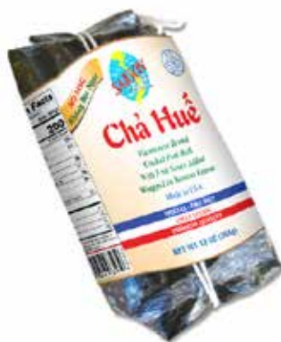
CHÀ HUẾ LÁ CHUỐI