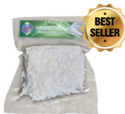
DỪA SỢI BẢO AN XÔI THƯỢNG HẠNG