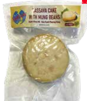
BÁNH KHOAI MÌ - ĐẬU XANH THƯỢNG HẠNG