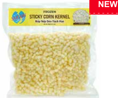
BẮP NẾP DẸO TÁCH HẠT