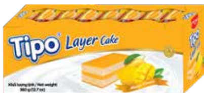
BÁNH BÔNG LAN KEM XOÀI