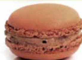
LEE'S MACARONS COFFEE (LEE'S MACARON VỊ CÀ PHÊ)