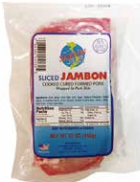
JAMBON THÁI LÁT