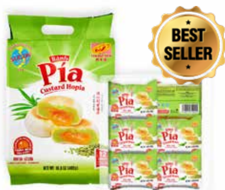
BÁNH PÍA NHỎ - KIM SA LÁ DỪA