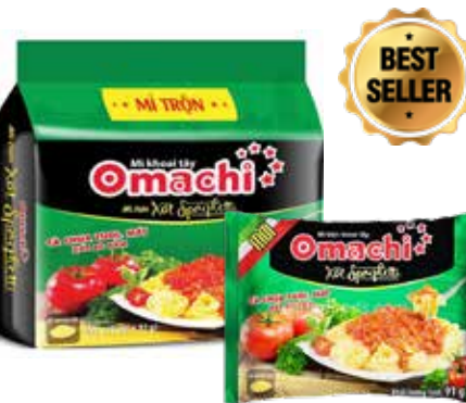
MÌ TRỘN OMACHI XÓT SPAGHETTI