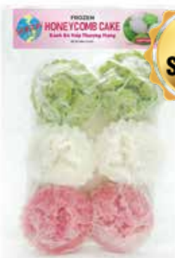
BÁNH BÒ HẤP THƯỢNG HẠNG