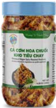
CÁ CƠM HOA CHUỐI KHO TIÊU CHAY