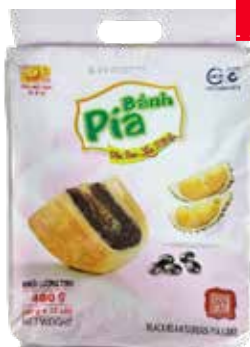
BÁNH PÍA NHỎ - ĐẬU ĐEN SÂU RIÊNG