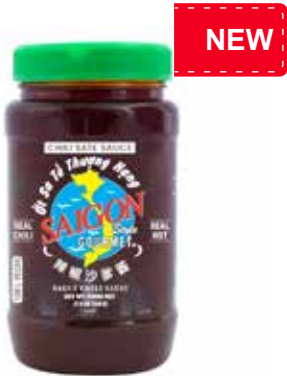
ỚT SA TẾ THƯỢNG HẠNG

DESCRIPTION: If you are a chili-lover, Saigon Gourmet Chili Sate is just for you. This hot chili sate sauce is made from Vietnamese fresh-ripened chillies with the secret traditional recipe and it is perfect for spreading on sandwiches, wraps, burgers, and more! INGREDIENTS: Chili, Soybean Oil, Garlic, Alpinia, Sugar, Salt, Vinegar, Potassium sorbate and Sodium Metabisulfite Preservatives. NO ARTIFICAL FLAVORS AND COLOR