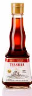
NƯỚC MẮM NHỊ CHÁNH HIỆU 40N - 250ML