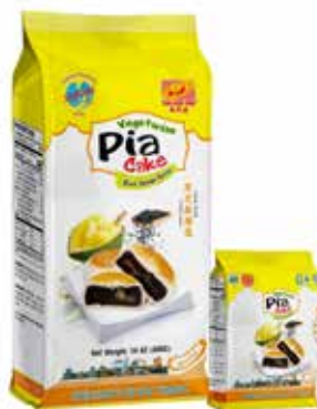
BÁNH PIA - SÂU RIÊNG MÈ ĐEN