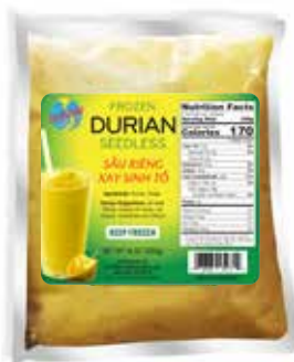
SÂU RIÊNG XÂY SINH TỐ