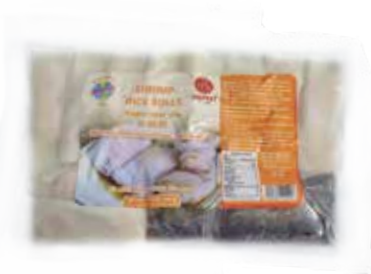
BÁNH CUÓN TÔM