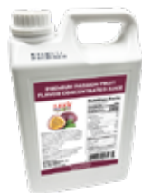
PREMIUM PASSION FRUIT FLAVOR CONCENTRATED JUICE