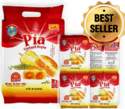
BÁNH PÍA ĐẬU XANH-SÂU RIÊNG-2 TRỨNG