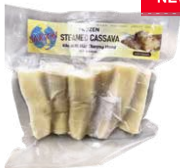
KHOAI MÌ HẤP THƯỢNG HẠNG