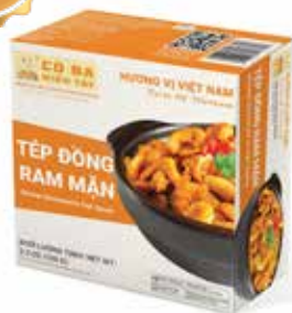
TÉP ĐỒNG RAM MẶN