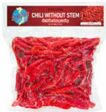
ỚT HIẾM KHÔNG CUỐNG