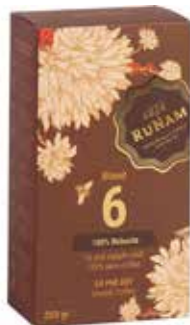
RUNAM CAFE PREMIUM LUXURY GROUND COFFEE 100% ROBUSTA #6