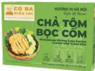
CHẢ TÔM BỌC CƠM