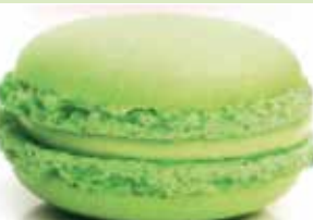
LEE'S MACARONS PISTACHIO (LEE'S MACARON VỊ PISTACHIO)