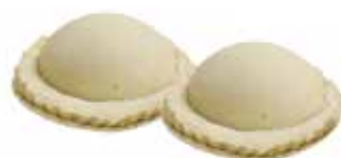
PIE PASTRY FOR PATE CHAUD (PORK & CHICKEN)