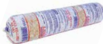
EGG ROLL FILLING RAW (NHÂN CHẢ GIÒ SỐNG)