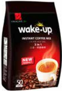
CÀ PHÊ HÒA TAN WAKE UP 3 IN 1 (50 gói)

Dairy creamer (glucose syrup, hydrogenated palm kernel oil, contain 2% or less of dipotassium phosphate, mono- and diglycerides, sodium caseinate (a milk derivative), silicon dioxide, sugar, milk solids, sodium hexametaphosphate, DATEM, salt, sodium tripolyphosphate, sodium citrate, -carotene color, articial avor), sugar, maltodextrin, instant coee mix (coee, soybeans), contain 2% or less of articial avors, salt, innamon powder. Contains: Milk and Soybeans.