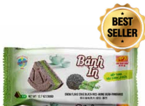
BÁNH IN - NẾP THAN ĐẬU XANH LÁ DỨA