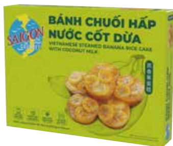
BÁNH CHUỐI HẤP NƯỚC CỐT DỪA