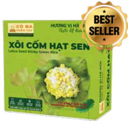
XÔI CỐM HẠT SEN