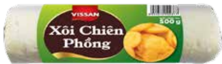
XÔI CHIÊN PHỒNG