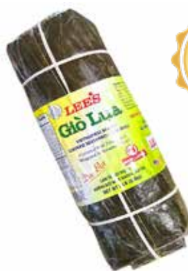
GIÒ LỤA LÁ CHUỐI 2LBS