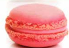
LEE'S MACARON RASPBERRY (LEE'S MACARON VỊ RASPBERRY)