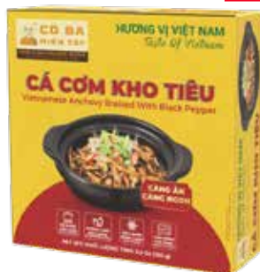
CÁ CƠM KHO TIÊU