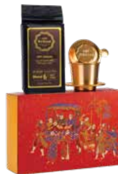
RUNAM COFFEE GIFT SET SET QUÀ TẶNG HƯƠNG XUÂN