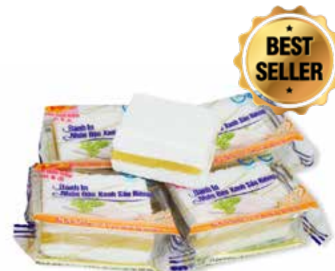
BÁNH IN - ĐẬU XANH SẦU RIÊNG