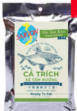
KHÔ CÁ TRÍCH XÉ TÂM NƯỚNG