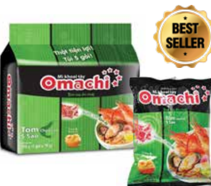
MÌ GÓI OMACHI TÔM CHUA CAY