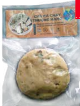
CHẢ CÁ CHAY THƯỢNG HẠNG