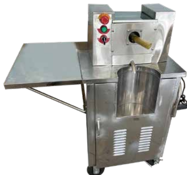
SUGAR CANE MACHINE CASTER 55X5 (MÁY ÉP MÍA)