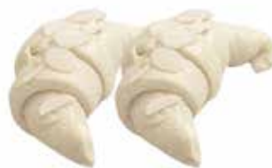
ALMOND CROISSANT ALMOND, ALL BUTTER, CROISSANT DOUGH