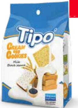
BÁNH TRỨNG KEM SỮA MÈ ĐEN TIPO