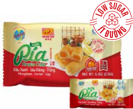
BÁNH PIA IT ĐƯỜNG ĐẬU XANH - SẦU RIÊNG - TRỨNG