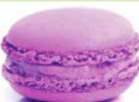
LEE'S MACARONS BLUEBERRY (LEE'S MACARON VỊ BLUEBERRY)