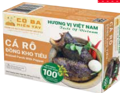
CÁ RÔ ĐỒNG KHO TIÊU