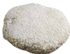
VIETNAMESE HOLLOW DONUTS DOUGH (BÁNH TIÊU)