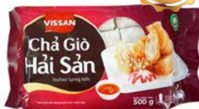
CHẢ GIÒ HẢI SẢN