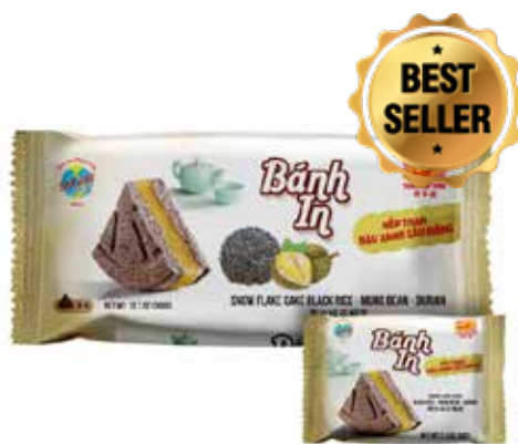
BÁNH IN - NẾP THAN ĐẬU XANH SÂU RIÊNG