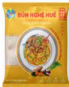
BÚN XÀO NGHỆ HUẾ