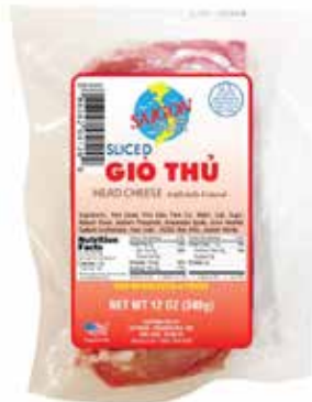
GIÒ THỦ THÁI LÁT