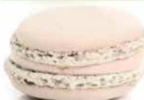
LEE'S MACARONS VANILLA (LEE'S MACARON VỊ VANI)