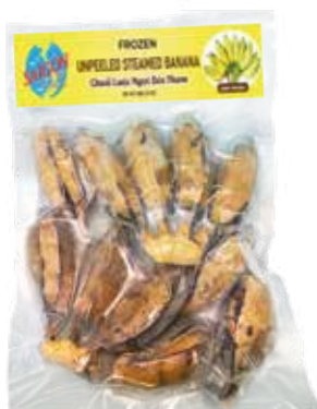
CHUÔI LƯỢC NGỌT DẸO THƠM