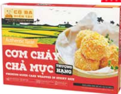
CƠM CHÁY CHẢ MỰC THƯỢNG HẠNG