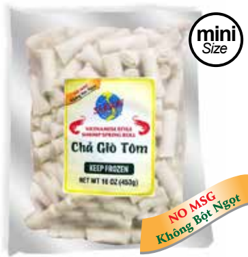
CHẢ GIÒ TÔM