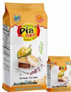
BÁNH PIA - ĐẬU ĐỎ SÂU RIÊNG