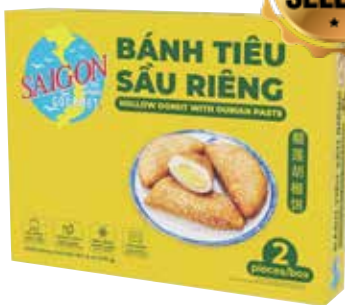
BÁNH TIÊU SẦU RIÊNG