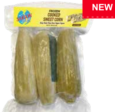
BẮP NẾP NẤU DẸO NGỌT NGON