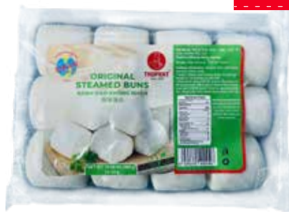
BÁNH BAO KHÔNG NHÂN