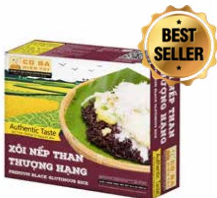
XÔI NẾP THAN THƯỢNG HẠNG