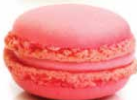
LEE'S MACARONS STRAWBERRY (LEE'S MACARON VỊ DÂU)