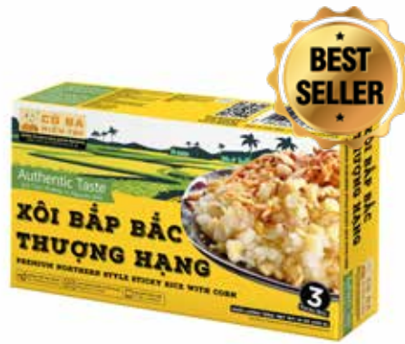
XÔI BẮP BẮC THƯỢNG HẠNG