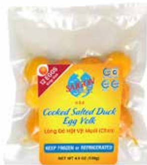
LÒNG ĐỎ HỘT VỊT MUỐI (CHÍN)