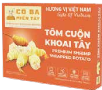
TÔM CUỘN KHOAI TÂY