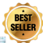
XOÀI LẮC MUỐI ỚT 100G