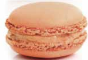
LEE'S MACARON MOCHA (LEE'S MACARON VỊ MOCHA)