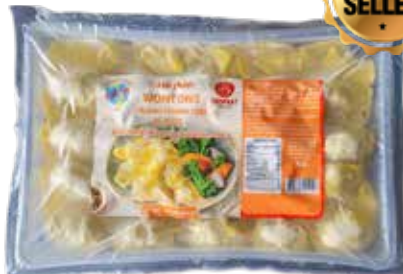
HOÀNH THÁNH TÔM