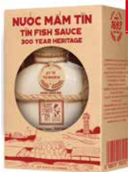
NƯỚC MẮM TÍN 41°N