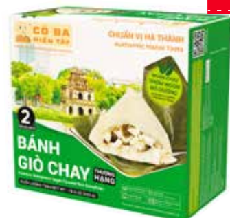
BÁNH GIÒ CHAY THƯỢNG HẠNG