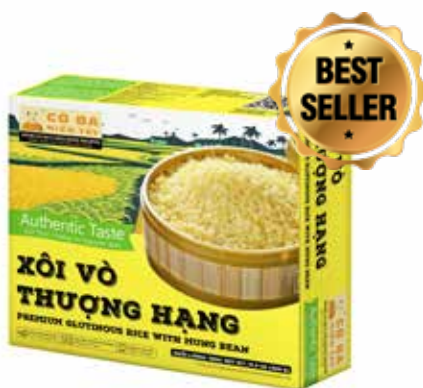
XÔI VỎ THƯỢNG HẠNG