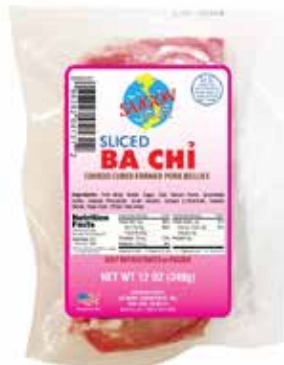
BA CHỈ THÁI LÁT