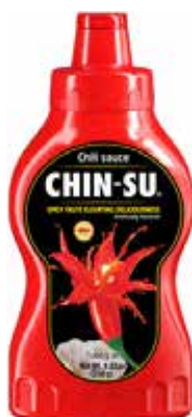
TƯƠNG ỚT CHINSU 500g