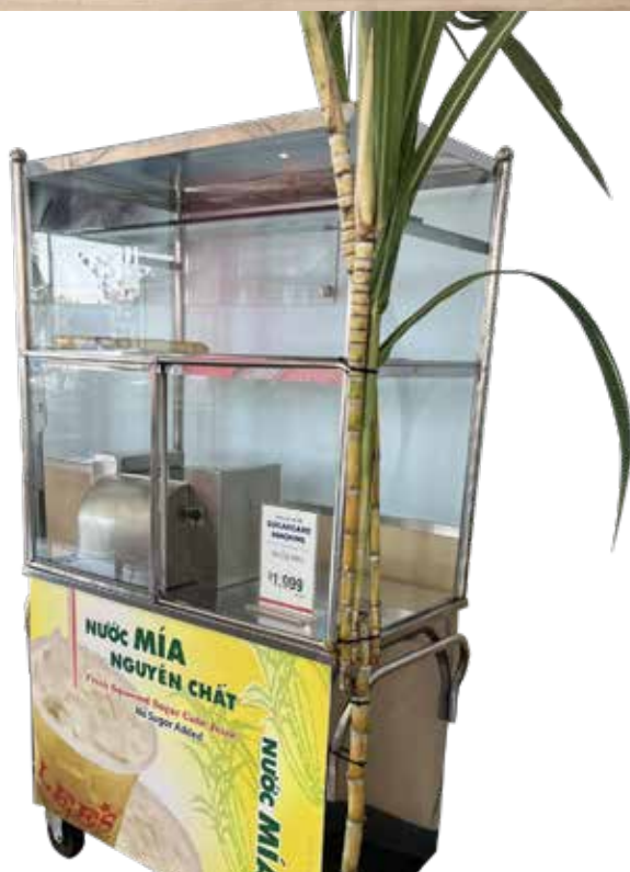
SUGARCANE MACHINE GLASS FRAME (XE ÉP MÍA)