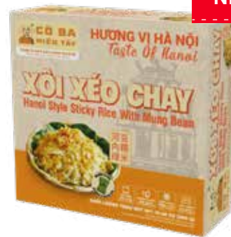
XÔI XÉO CHAY