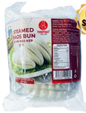
BÁNH BAO KẸP