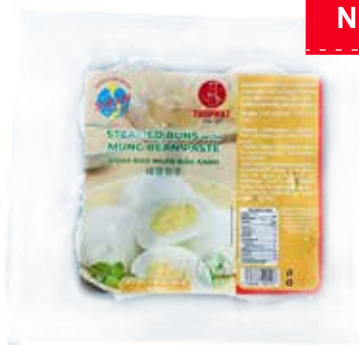
BÁNH BAO NHÂN ĐẬU XANH