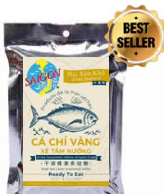
KHÔ CÁ CHỈ VÀNG TÂM GHÉP NƯỚNG