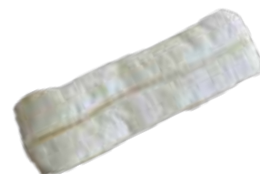
CHINESE BREAD STICKS (DẦU CHÉO QUẦY)