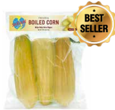
BẮP NẾP DẸO NGỌT