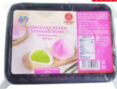
BÁNH TRÁI ĐÀO