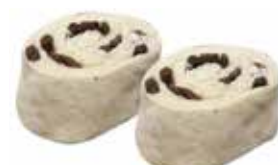
COCONUT RAISIN CROISSANT ALL BUTTER, RAISIN, CROISSANT DOUGH