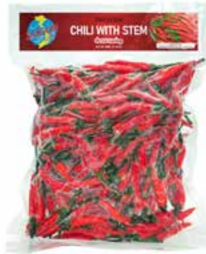
ỚT CÓ CUỐNG