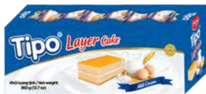
BÁNH BÔNG LAN KEM TRỨNG