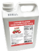
LYCHEE FLAVOR CONCENTRATED JUICE