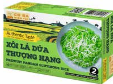
XÔI LÁ DỨA THƯỢNG HẠNG