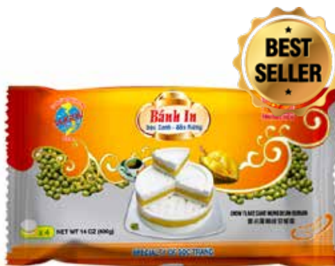
BÁNH IN - ĐẬU XANH SẦU RIÊNG