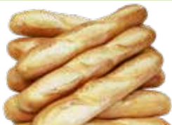
BREADSTICKS (BÁNH MÌ QUE)