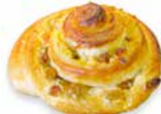
FULLY BAKED COCONUT RAISIN CROISSANT (BÁNH CROISSANT CUỘN NHỎ)