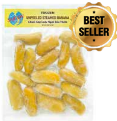
CHUÔI SÁP LƯỢC NGON DẸO THƠM LỘT VỎ