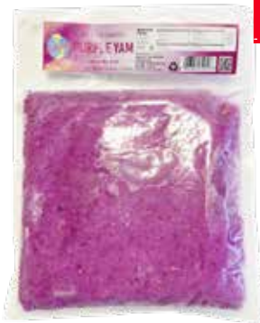
KHOAI MỠ BẢO