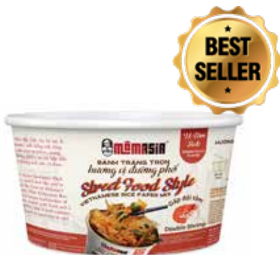
BÁNH TRÁNG TRỘN