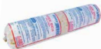
PORK BUN FILLING RAW (NHÂN BÁNH BAO SỐNG)