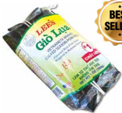
GIÒ LỤA LÁ CHUỐI