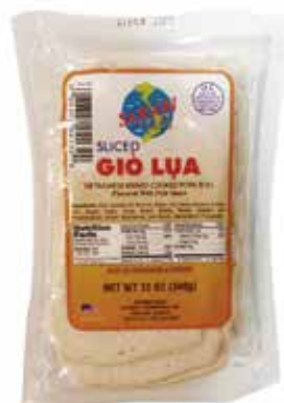
GIÒ LỤA THÁI LÁT