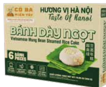
BÁNH DẦY NGỌT