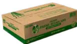
FROZEN FRESH SUGARCANE (MÍA TƯƠI ĐÔNG LẠNH)