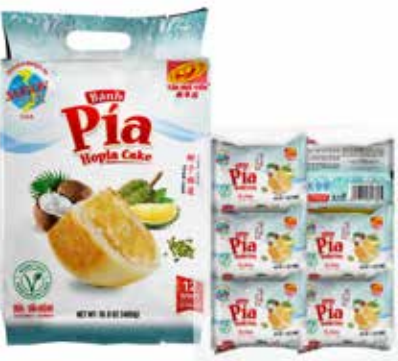
BÁNH PÍA NHỎ - DỪA SÂU RIÊNG