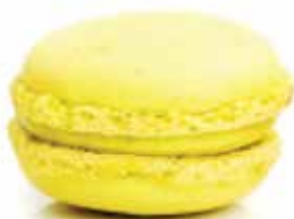
LEE'S MACARONS LEMON (LEE'S MACARON VỊ CHANH)