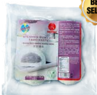
BÁNH BAO NHÂN KHOAI MÔN