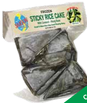
BÁNH ÍT NHÂN DỪA- ĐẬU XANH THƯỢNG HẠNG