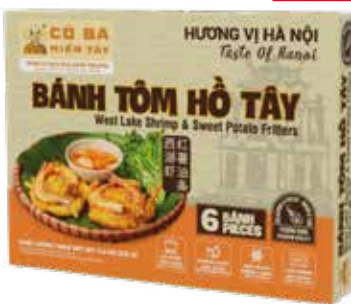
BÁNH TÔM HỒ TÂY