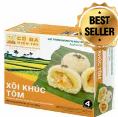
XÔI KHÚC TÔM