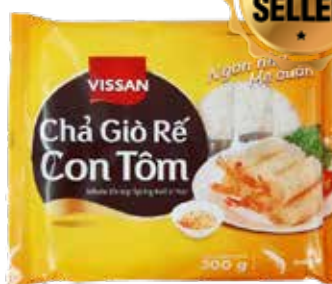
CHẢ GIÒ RẾ CON TÔM