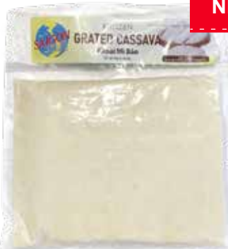
KHOAI MÌ BẢO