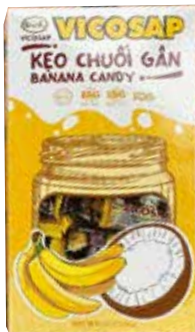
KẸO CHUỐI GÂN