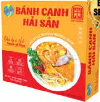
BÁNH CANH HẢI SẢN