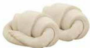
BUTTER CROISSANT CROISSANT DOUGH, ALL BUTTER (LARGE)