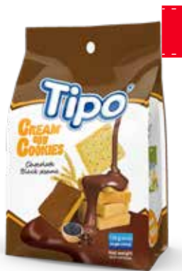
BÁNH TRỨNG MÈ ĐEN SÔ CÔ LA TIPO