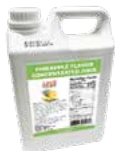
PINEAPPLE FLAVOR CONCENTRATED JUICE