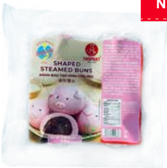
BÁNH BAO TẠO HÌNH CON HEO