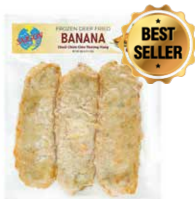
CHUỐI CHIÊN GIÒN THƯỢNG HẠNG