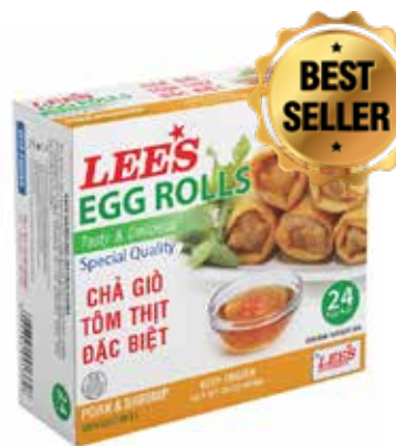
CHẢ GIÒ TÔM THỊT ĐẶC BIỆT