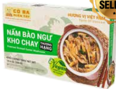
NẤM BÀO NGƯ KHO CHAY THƯỢNG HẠNG