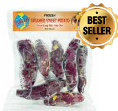
KHOAI LANG MẬT HẤP CHÍN