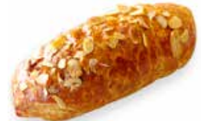
FULLY BAKED ALMOND CROISSANT (BÁNH CROISSANT HẠNH NHÂN)