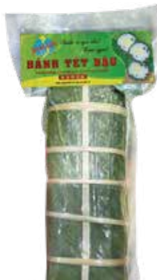
BÁNH TÉT ĐẬU