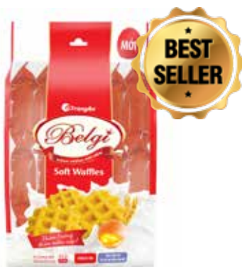
BÁNH TRÚNG SỮA MỀM