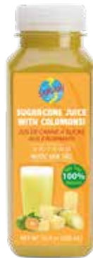
NƯỚC MÍA TẮC