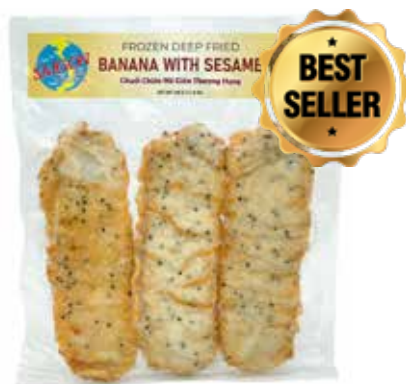
CHUỐI CHIÊN MÈ GIÒN THƯỢNG HẠNG