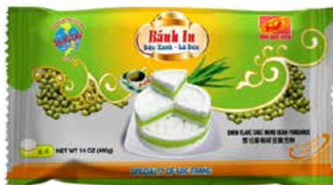
BANH IN - ĐẬU XANH LÁ DỨA