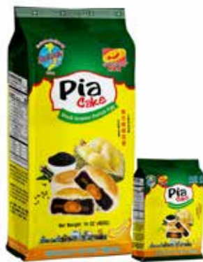
BÁNH PIA MÈ ĐEN - SÂU RIÊNG - TRỨNG