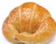
FULLY BAKED LEE'S SIGNATURE CLASSIC FRENCH CROISSANT (BÁNH CROISSANT LỚN)