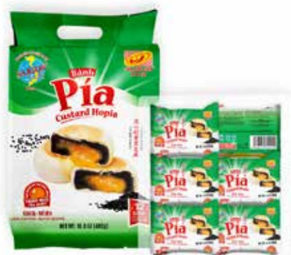
BÁNH PÍA NHỎ - KIM SA MÈ ĐEN