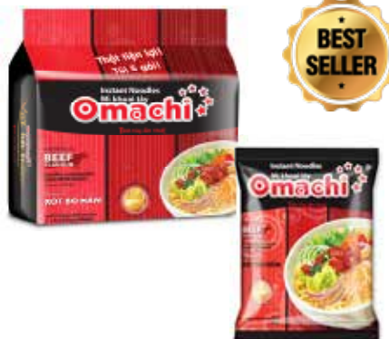
MÌ GÓI OMACHI SÓT BÒ HẦM