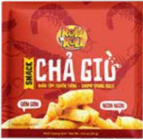
SNACK CHẢ GIÒ NHÂN TÔM TRUYỀN THỐNG