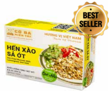
HÉN XÀO SẢ ỚT

Mussels, lemongrass, fish sauce (Water, salt, anchovy: > 97%, Monosodium glutamate (621), disodium 5'-ribonucleotides (635), citric acid (330), synthetic flavoring, plain caramel (150a), carmines (120), sugar, sodium benzoate (211), aspartame (951), xanthan gum (415), gardenia yellow: <3%), soybean oil, water, sugar, garlic, purple onion, chili, salt.