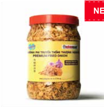
HÀNH PHI TRUYỀN THỐNG THƯỢNG HẠNG