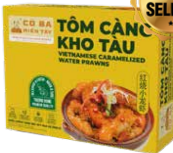
TÔM CÀNG KHO TÀU