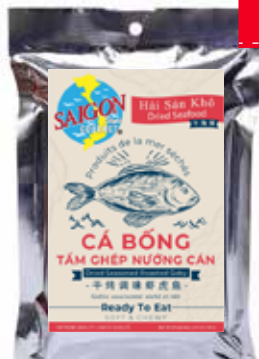
KHÔ CÁ BÔNG TÂM GHÉP NƯỚNG CÁN