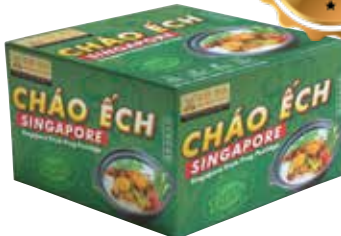
CHÁO ẾCH SINGAPORE