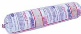
SANDWICHES BALL FILLING RAW (NHÂN XÍU MẠI SỐNG)