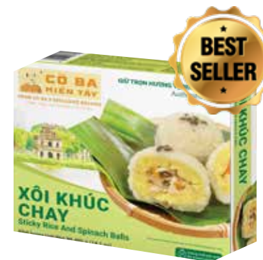
XÔI KHÚC CHAY