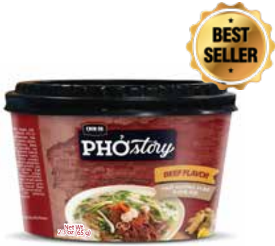
PHỞ HƯƠNG VỊ BÒ

Rice, food starch-modified, sugar, salt, palm oil, potato starch, contain 2% or less of monosodium glutamate, fish sauce, artificial beef flavor, water, onion, shallot, culantro, yeast extract, dried green onion, cinnamon powder, soy protein, textured wheat protein (wheat protein, wheat flour, caramel color), ginger, chili pepper, onion powder, disodium inosinate, disodium guanylate, artificial flavor, chili pepper powder, star anise powder, ginger powder, high fructose corn syrup, black pepper powder, sodium carboxymethylcellulose, garlic, garlic powder, tomato paste, citric acid, acetic acid, xanthan gum, acesulfame potassium, natural flavor, BHA (preservative), BHT (preservative). Contains: wheat, fish (anchovy), soybean, tree nut (coconut).