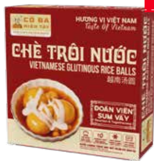
CHÈ TRÔI NƯỚC