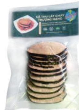
CÁ THU LÁT CHAY THƯỢNG HẠNG