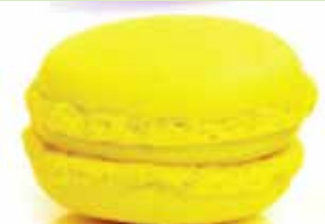
LEE'S MACARON PINEAPPLE (LEE'S MACARON VỊ KHÓM)