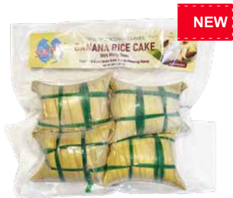
BÁNH LÁ DỪA NHÂN ĐẬU XANH THƯỢNG HẠNG