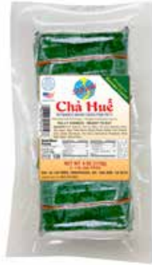
CHẢ HUẾ LÁ CHUỐI 4 oz