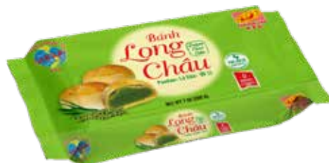
BÁNH LONG CHÂU LÁ DỨA