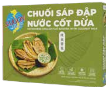
CHUỐI SẤP ĐẬP NƯỚC CỐT DỪA