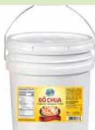
VIETNAMESE PICKLES FOR BANH MI (ĐỒ CHUA LÀM BÁNH MÌ VIỆT NAM)