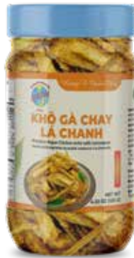
KHÔ GÀ CHAY LÁ CHANH