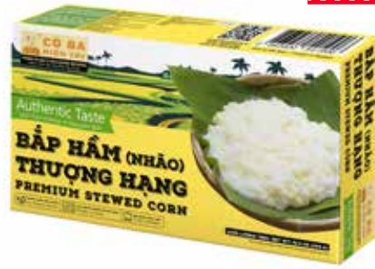
BẮP HẦM (NHẢO) THƯỢNG HẠNG