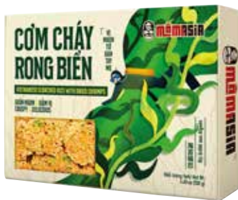
CƠM CHÁY RONG BIỂN