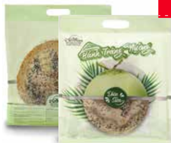
BÁNH TRÁNG DỪA SỮA