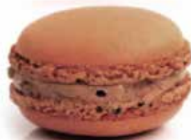
LEE'S MACARONS CHOCOLATE (LEE'S MACARON VỊ SÔCOLA)