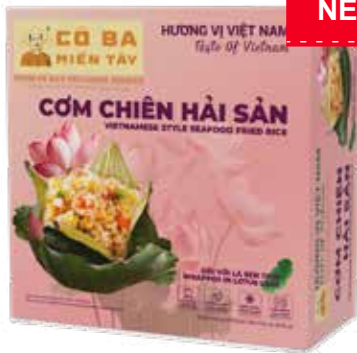
CƠM CHIÊN HẢI SẢN