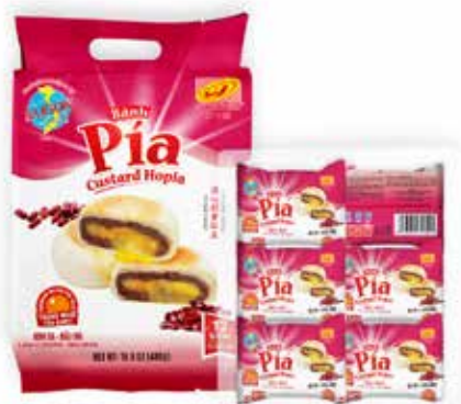
BÁNH PÍA NHỎ - KIM SA ĐẬU ĐỎ