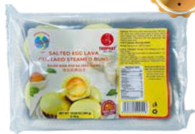
BÁNH BAO KIM SA HẢO HẠNG