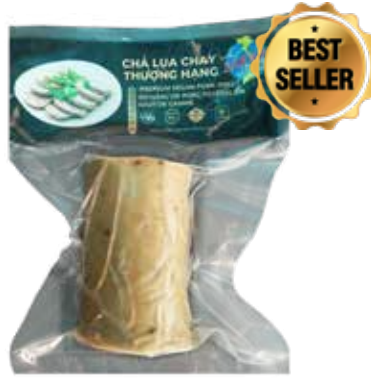
CHẢ LỤA CHAY THƯỢNG HẠNG