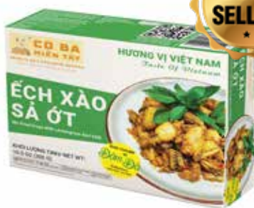
ẾCH XÀO SẢ ỚT