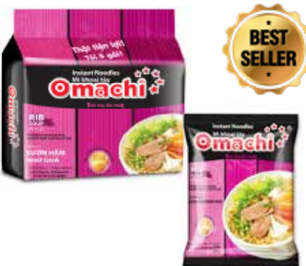
MÌ GÓI OMACHI SƯỜN HẦM NGŨ QUẢ