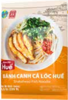
BÁNH CANH CÁ LỘC HUẾ