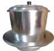
COFFEE FILTER BIG SIZE (BỘ LỌC CÀ PHÊ SIZE LỚN)