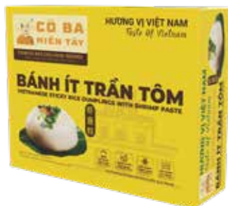
BÁNH ÍT TRẦN TÔM