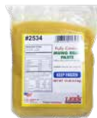
FULLY COOKED MUNG BEAN PASTE (ĐẬU XANH NẤU CHÍN)