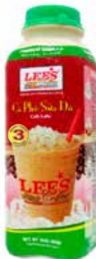
CAFE SỮA ĐÁ HƯƠNG VANILLA