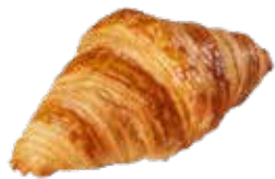
FULLY BAKED STRAIGHT CROISSANT (BÁNH CROISSANT NHỎ)