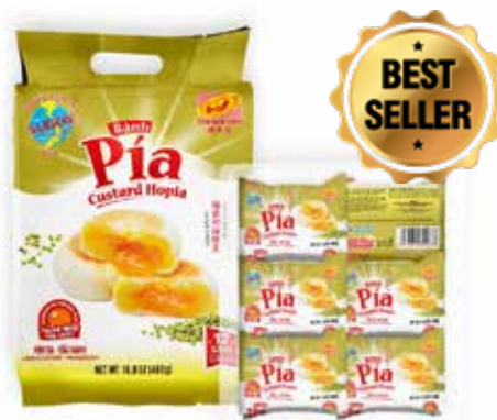
BÁNH PÍA NHỎ - KIM SA ĐẬU XANH