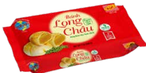
BÁNH LONG CHÂU ĐẬU XANH