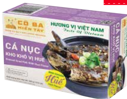
CÁ NỤC KHO VỊ HUẾ