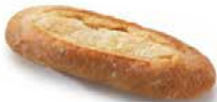
FULLY BAKED LEE'S SIGNATURE FRENCH DEMI BAGUETTE (BÁNH MÌ BAGUETTE NHỎ)