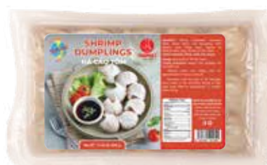
HÁ CẢO TÔM