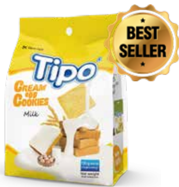
BÁNH TRỨNG KEM SỮA TIPO