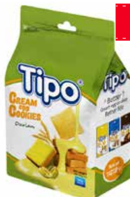
BÁNH TRỨNG KEM SÂU RIÊNG TIPO