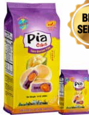
BÁNH PIA KHOAI MÓN - SẦU RIÊNG - TRỨNG