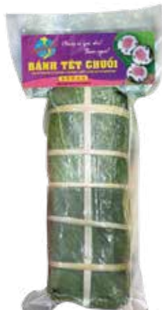
BÁNH TÉT CHUỐI