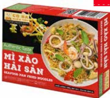
MÌ XÀO HẢI SẢN THƯỢNG HẠNG