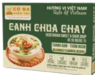
CANH CHUA CHAY