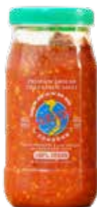
TƯƠNG ÓT BẦM TỎI 510G