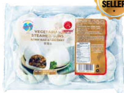
BÁNH BAO NHÂN CHAY