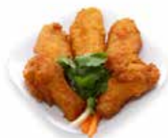
CHICKEN WING ZING (CÁNH GÀ)