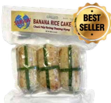
CHUỐI NẾP NƯỚNG THƯỢNG HẠNG