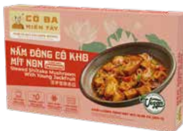
NẤM ĐÔNG CÔ KHO MÍT NON