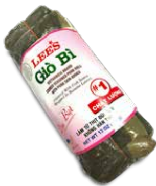
GIÒ BÌ LÁ CHUỐI