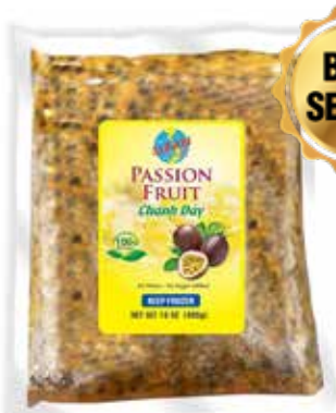
CHANH DÂY NGUYÊN CHẤT