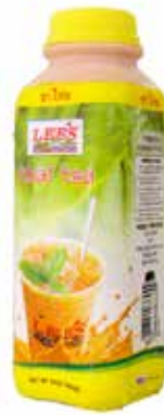
TRÁ SỮA THÁI