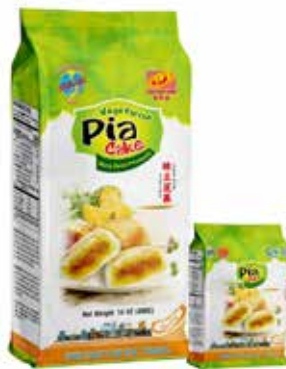
BÁNH PIA - THƠM SÂU RIÊNG