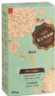
RUNAM CAFE PREMIUM LUXURY GROUND COFFEE 100% ARABICA #1