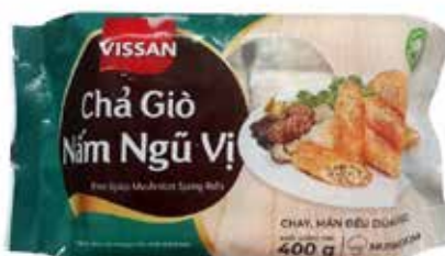
CHẢ GIÒ NĂM NGŨ VỊ