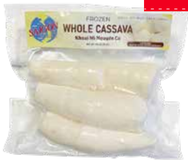
KHOAI MÌ NGUYÊN CỦ