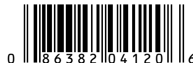
LAP XUONG MAI QUE LO - HEO & TOM

Grill: Grill over medium heat; turn frequently. Oven: Preheat oven to 450oF. Place sausage in oven for about 5 minutes. Enjoy!