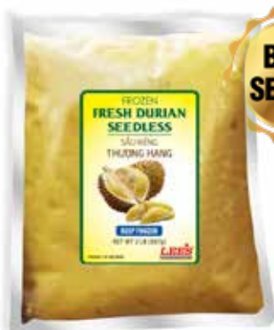
SÂU RIÊNG CÁI MÓN THƯỢNG HẠNG