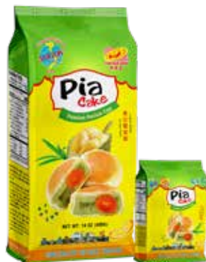
BÁNH PIA LÁ DỨA - SÂU RIÊNG - TRỨNG