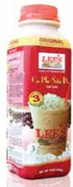
CAFE SỮA ĐÁ TRUYỀN THỐNG