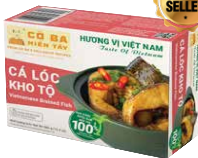
CÁ LỘC KHO TỘ NƯỚC DỪA