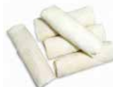
EGG ROLL (CHẢ GIÒ)