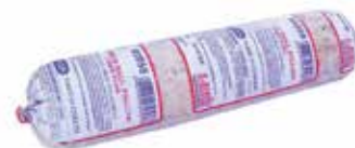
MEAT BALL FILLING FULLY COOKED (NHÂN XÍU MẠI CHÍN)