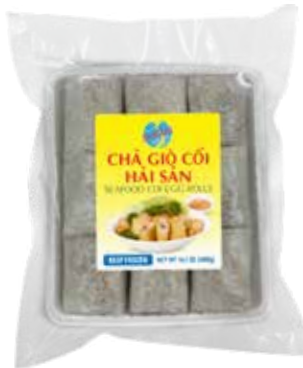
CHẢ GIÒ CỎI HẢI SẢN