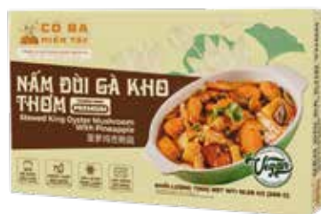
NẤM DỒI GÀ KHO THƠM