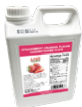
STRAWBERRY CRUSHED FLAVOR CONCENTRATED JUICE