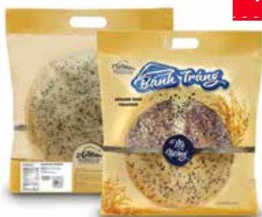
BÁNH TRÁNG MÈ NƯỚNG