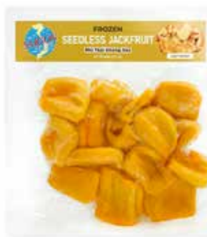
MÍT NGHỆ KHÔNG HẠT