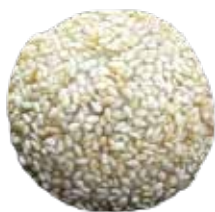
MUNG BEAN SESAME BALL DOUGH (BÁNH CAM NHÂN ĐẬU XANH)