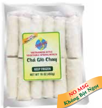
CHẢ GIÒ CHAY