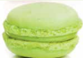
LEE'S MACARONS MATCHA GREEN TEA (LEE'S MACARON VỊ TRÀ XANH)