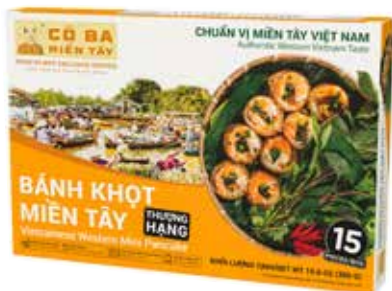
BÁNH KHỌT MIỀN TÂY THƯỢNG HẠNG