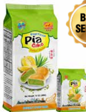
BÁNH PIA - SÂU RIÊNG LÁ DỪA