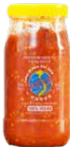
TƯƠNG ÓT BẦM 510G