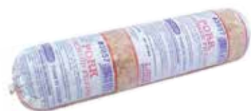
PATECHAUD FILLING (NHÂN PATE SÔ)