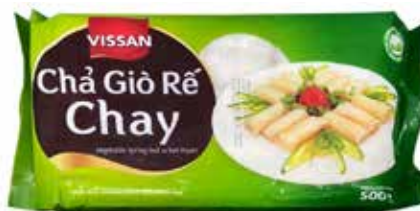
CHẢ GIÒ RẾ CHAY