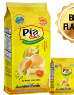
BÁNH PIA - ĐẬU XANH - SẦU RIÊNG - TRỨNG