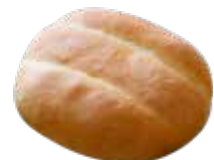
FULLY BAKED LEE'S SIGNATURE TELERA BREAD (BÁNH MỠ MỀ)