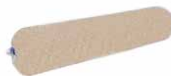
PORK PATTY FULLY COOKED FOR FRIED PORK ROLL (CHẢ CHIÊN)