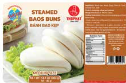
BÁNH BAO KẸP