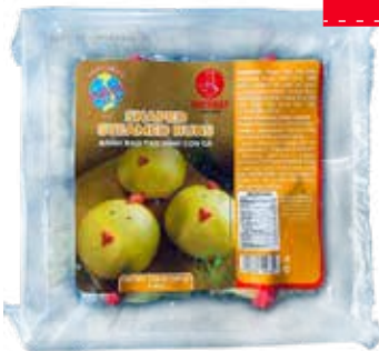
BÁNH BAO TẠO HÌNH CON GÀ