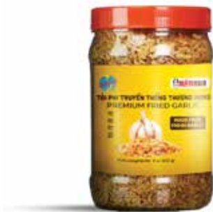
TÔI PHI TRUYỀN THỐNG THƯỢNG HẠNG