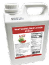
WATERMELON FLAVOR SYRUP