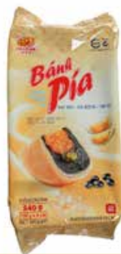
BÁNH PIA ĐẬU ĐEN - SÂU RIÊNG - TRỨNG