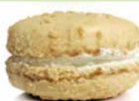
LEE'S MACARONS COCONUT (LEE'S MACARON VỊ DỪA)