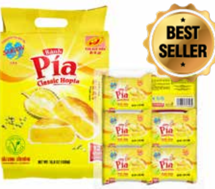
BÁNH PÍA NHỎ - ĐẬU XANH SÂU RIÊNG TRUYỀN THÔNG