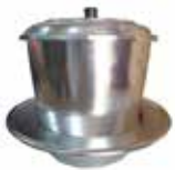
COFFEE FILTER SMALL SIZE (BỘ LỌC CÀ PHÊ SIZE NHỎ)