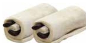
CHOCOLATE CROISSANT ALL BUTTER, CHOCOLATE, CROISSANT DOUGH