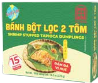
BÁNH BỘT LỘC 2 TÔM