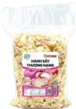
HÀNH SẤY THƯỢNG HẠNG