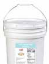
HIGH FRUCTOSE SYRUPS