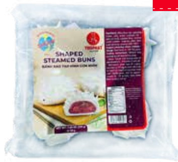
BÁNH BAO TẠO HÌNH CON NHÍM