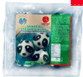
BÁNH BAO TẠO HÌNH CON GẤU